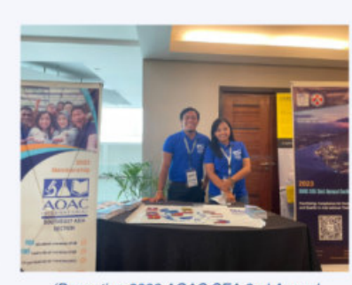
(Promoting 2023 AOAC SEA 2nd Annual Conference at the APFAN International Workshop)

Let us not be hampered by our language and cultural differences to connect with each other and establish a network. Let us maximize the benefits of the conference and enjoy the professional bonding in this annual event. See you at the 2nd AOAC Annual Conference.